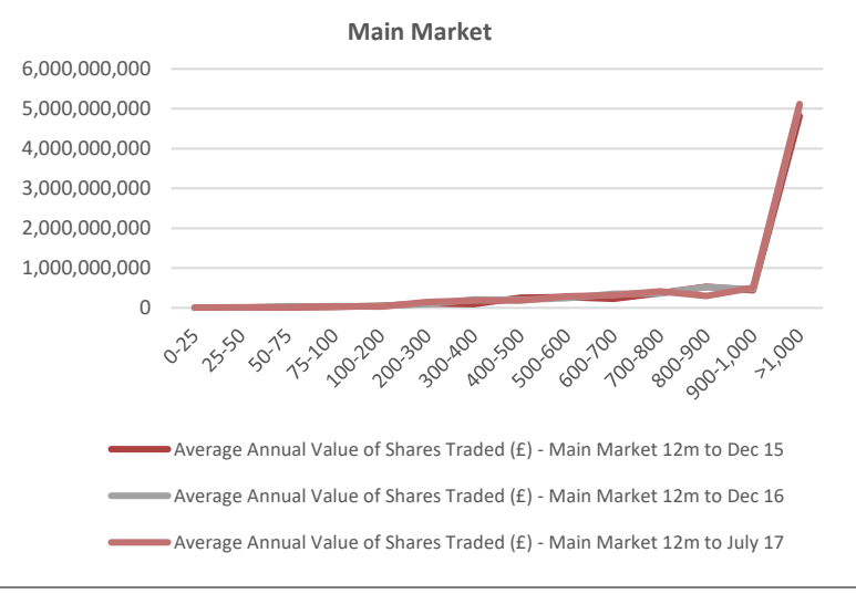
Figure 2: Average Annual Value of Shares Traded by Market Cap Band per 12m Period